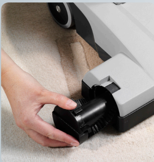
The brush is easily accessed without the need for tools for easy replacement, maintenance and cleaning